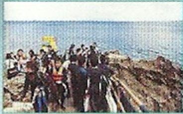
One of the most famous diving points on the island. (Paid parking hours: December-February 7:00-17:30; March-April -18:30)