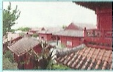
This is a cultural theme park reminiscent of the grandeur of the Ryukyu Kingdom. The park offers over 100 arts and crafts workshops and classes in cultural activities as well as karate lessons for visitors.