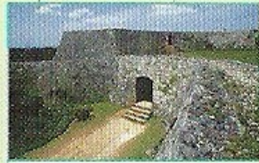
Overlooking a splendid panorama of the East China Sea, this is a popular spot for a picnic.