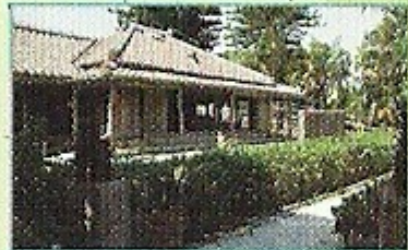
Ryukyu Mura is a cultural theme park offering a taste of the traditional lifestyle of Okinawa. The park's main attractions include traditional entertainment shows.